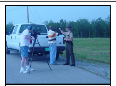
THP filmed a video scenario for the fact pattern.